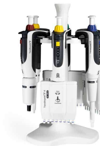
Bench top rack for 6 Transferpette® S single- or multi-channel pipettes.