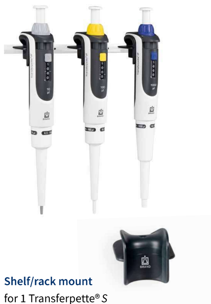
Shelf/rack mount for 1 Transferpette® S single- or multi-channel pipette.

With holders and stands, the devices are always properly stored and close at hand for the next application.