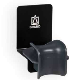
Wall mount for 1 Transferpette® S single- or multi-channel pipette.