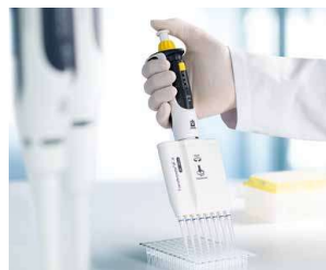
Working with PCR plates