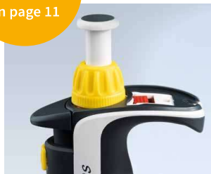
Easy Calibration technology