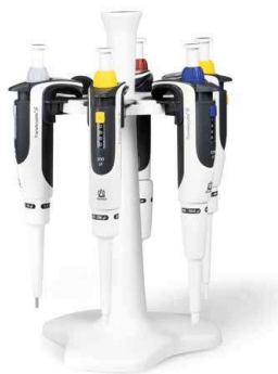
Pipette Package 2