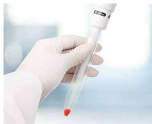
Narrow centrifuge tubes

Individual nose cones and seals can be easily removed for cleaning or replacement