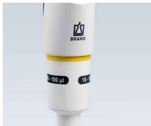
Integrated shaft coupling