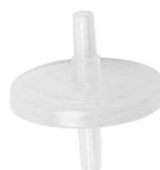
.45 µm and .22 µm filters