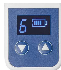
LCD indicates battery charge level and aspirate / dispense speed settings