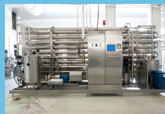
Equipment & Instrumentation