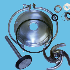
Process Repair Parts