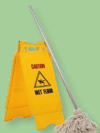
Sanitary Maintenance & Janitorial