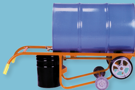
Drum Handling Products