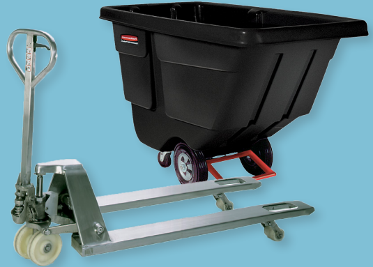
Carts & Trucks