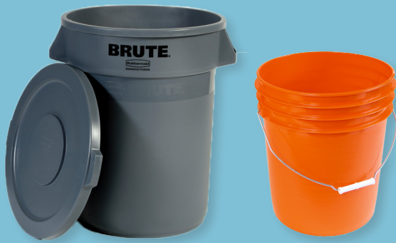
Pails, Totes, Drums & Containers