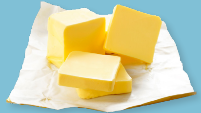
Food Grade Packaging