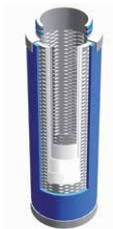
P-FF, P-MF, and P-SMF

By using various filtration mechanisms such as impaction, sieving, and diffusion, liquid aerosols and solid particles down to the size of 0.01 µm are being retained in the filter.