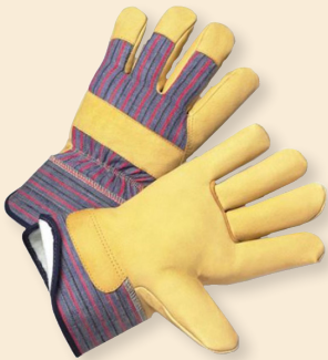
Cold Weather Accessories