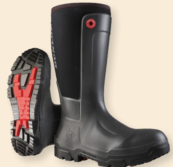
Footwear & Ice Traction

Apparel and accessories to keep your employees warm and dry during the winter season.