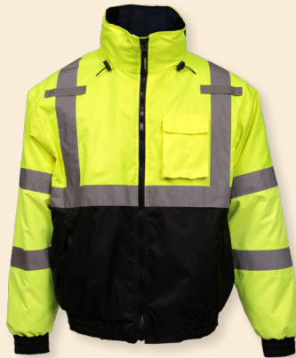
Sweatshirts & Jackets