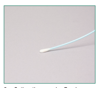
Gather the sample. For dry surfaces moisten with extraction solution. Do not premoisten for wet surfaces.