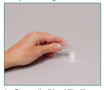
1. Remove the lid and fill with liquid from the tube.