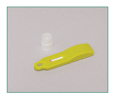
4. Place the device on a flat surface and allow the test to develop for 5 minutes.