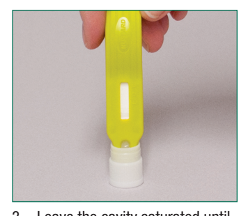
Leave the cavity saturated until the liquid is seen running into the test window.