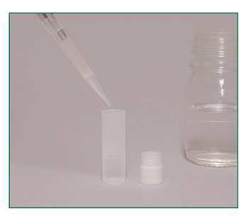
Add 1 mL of sample to the sample tube.